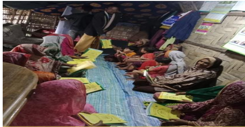
Education Activities are going on

supervisors to implement this program. At present training activities of teachers & supervisors are going on. In October 2019 the teachers and supervisors were selected and trained by BNFE. They Surveyed 24000 illiterate people from Pekua Upazila by the baseline survey. Of 24000 illiterates 18,000 are selected for 300 centers. All of our centers are moderated by 2 shifts - male & Female. For Covid -19 our six-month projects can't run in. 8th December 2021 again we have started our Centre following to instructions of the Government. Project activities such as class, monitoring, etc. are continuing. Books, exercise books, pen, Blackboard, Signboard, Eraser, Floor mat, light, Chalk, etc. are disbursed into the learning center in time properly. There are 300 CMC, 7 ULC, and a UNFE committee in our project area.