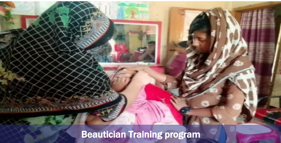
Beautician Training program

It is distinctly evident that 57% of adolescent girls are at risk of child marriage, sexual exploitation, abuse, and negligence. Therefore, PHALS and BRAC are working together to mitigate this alarming concern through a skill development program for the host communities in Pekua. The skill development program has been specially designed for poor and disadvantaged adolescents (ages 14 to 18). The overall objective of the project is to develop employable skills and establish job linkage for marginalized and disadvantaged adolescents (Age 14 -18 male and female to create better opportunities for their livelihood and make them empowered. In this perspective, Pekua Upazila is divided into two branches such as pekua 1 and pekua 2. Pekua 1 is divided into Pekua Sadar and