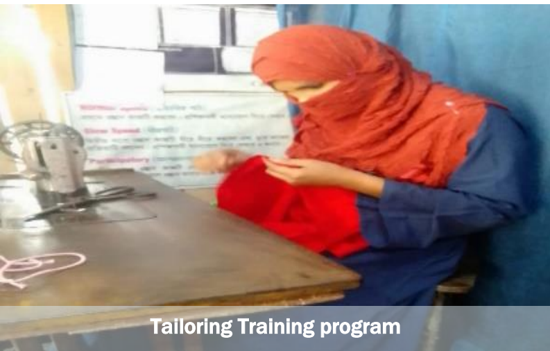
Tailoring Training program

some parts of Rajakhali Union and Pekua 2 is divided into Magnama Union, the rest of Rajakhali Union, and some parts of Pekua Sadar. In pekua dropped out under SSC at the age of 14-18 (Especially 20) years 100 learners are trained up in these two Branches. 100 learners are divided into 5 parts. Of these, 64 learners have been provided Tailoring and Dress Making (TDM), 46 females and 18 males, 16 learners have been provided IT, Support Technician (IST), 10 lines have been provided Beauty Salon and Fashion (BSF), and 10 learners have been provided Mobile Phone Servicing Training (MPS).