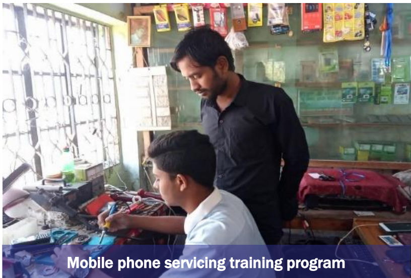
Mobile phone servicing training program

It is distinctly evident that 57% of adolescent girls are at risk of child marriage, sexual exploitation, abuse, and negligence. Therefore, PHALS and BRAC are working together to mitigate this alarming concern through a skill development program for the host communities in Pekua. The skill development program has been specially designed for poor and disadvantaged adolescents (ages 14 to 18). The overall objective of the project is to develop employable skills and establish job linkage for marginalized and disadvantaged adolescents (Age 14 -18 male and female to create better opportunities for their livelihood and make them empowered. In this perspective, Pekua Upazila is divided into two branches such as pekua 1 and pekua 2. Pekua 1 is divided into Pekua Sadar and